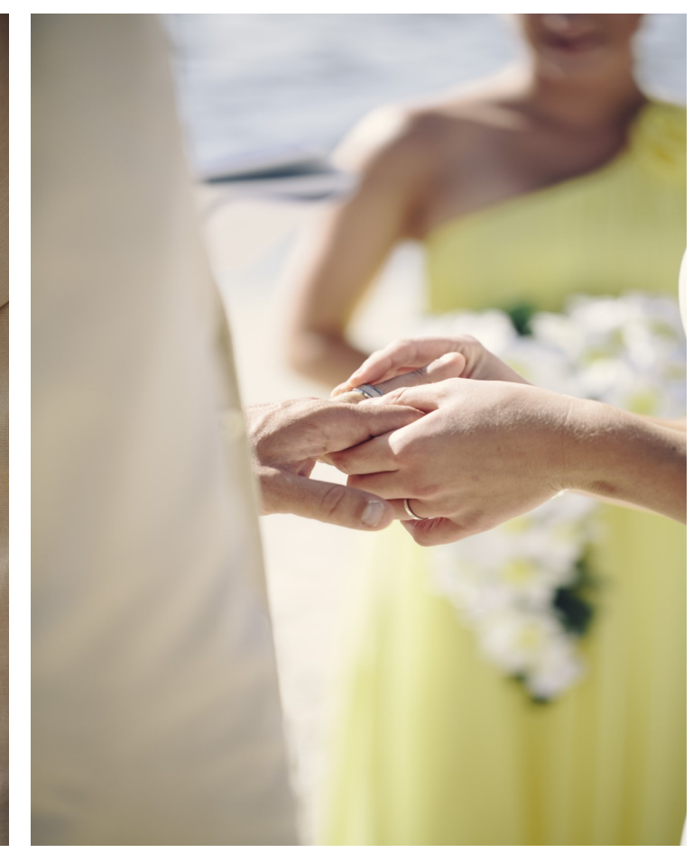
Lady Elliot Island Eco Resort