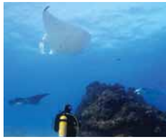
Manta rays at a cleaning station