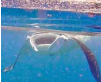
Feeding manta ray