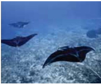
Manta rays in a courtship train