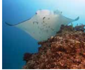
Cleaning manta ray

Manta rays feed by using their cephalic lobes to funnel water into their wide mouth and through their gills. Specialised structures on their gills, called 'gill rakers', will help sieve zooplankton from the water. Depending on the abundance and type of zooplankton, manta rays will show different feeding behaviours.